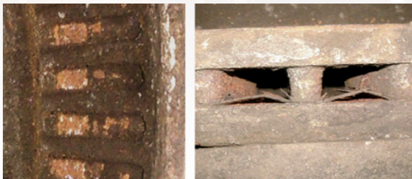
26 months/32,789 miles WITHOUT Webb LifeShield™ protection